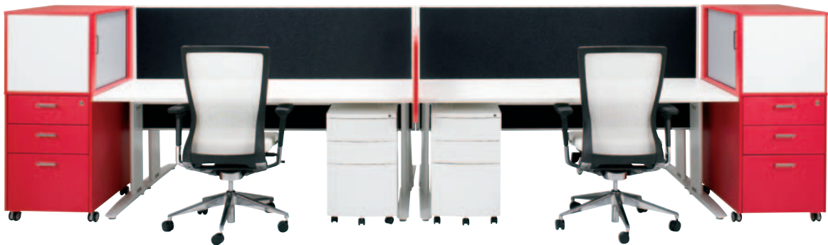
Designer Storage Docking Towers in Pillarbox Red with Symmetry Smart White Workstations.