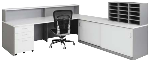
Symmetry Operator Reception Counter with Sliding Door Buffet and Pigeon Hole Unit