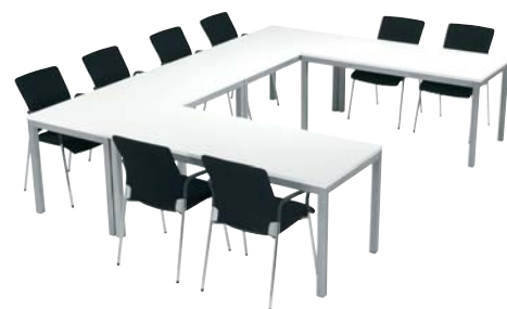
Cubit Training Tables with Silver Frame