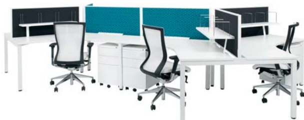
Cubit Smart - 120° Workstations