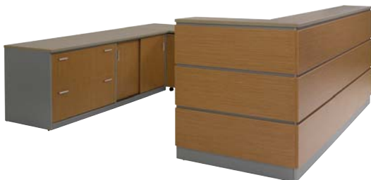
Symmetry Deluxe Reception Counter