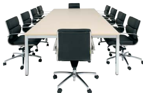
Cubit Boardroom Table with Chrome Frame