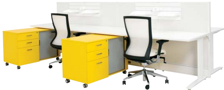
Cubit 50 - 6 Person 120° Workstation Cluster White Powdercoat