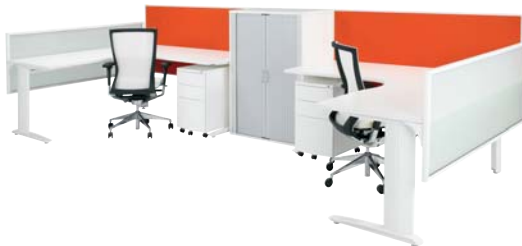
Symmetry Smart 2 Person Corner Cluster