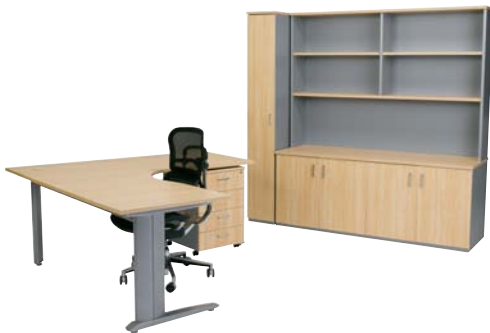
Symmetry Executive Cluster with Symmetry Furniture Items