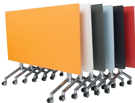
Velocity Flip top tables with Chrome Frame