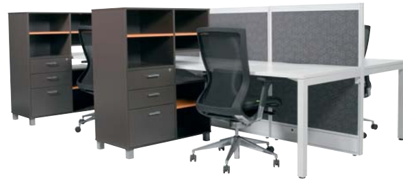
Cubit 50 4 Person Straight Cluster with Jigsaw Storage Units