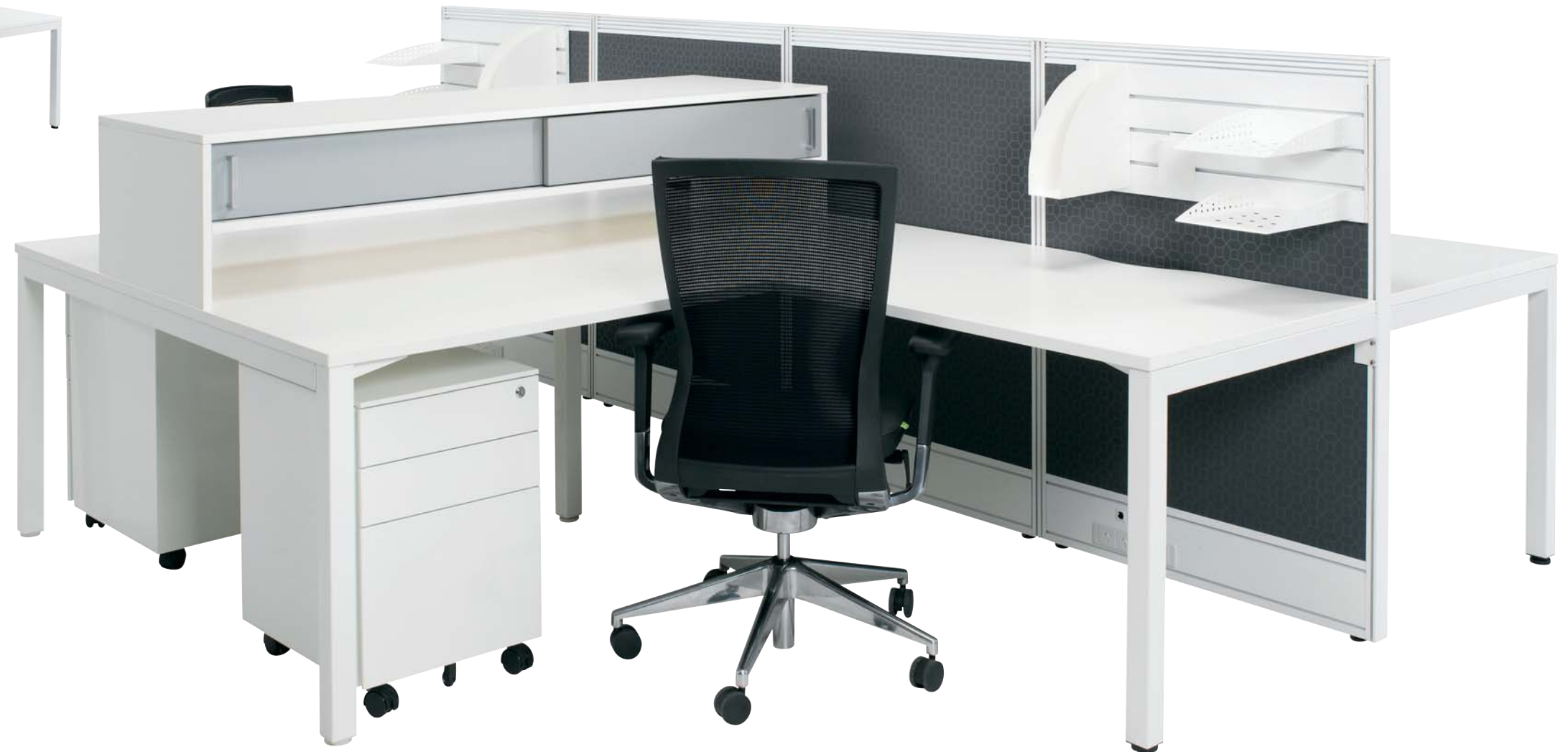
Cubit 50 2 Person Corner Workstation Cluster with Divide Storage unit